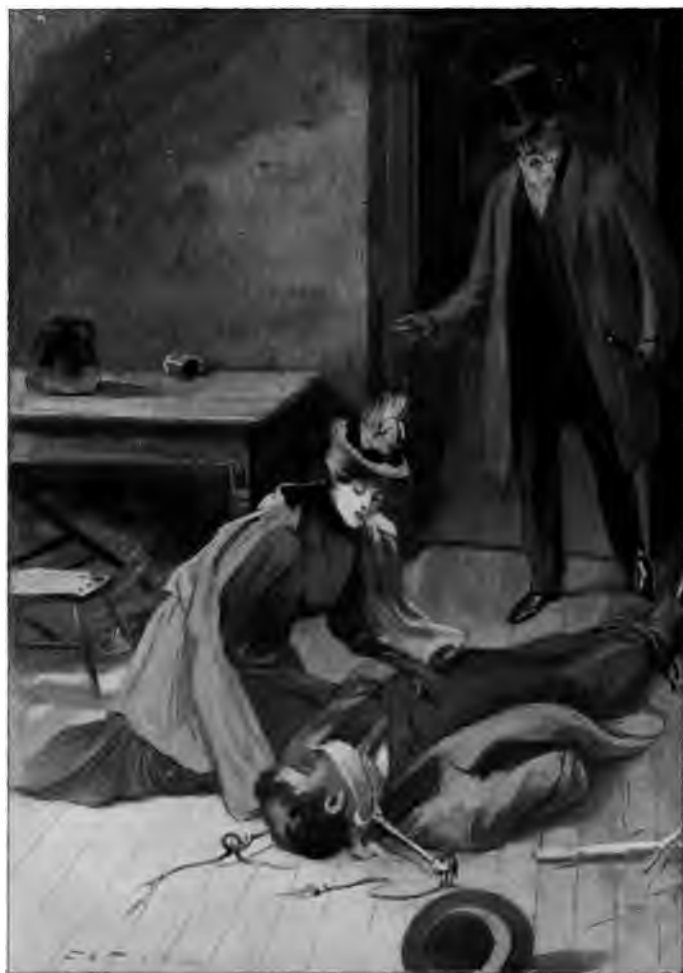
She was on her knees beside him.—Page 249